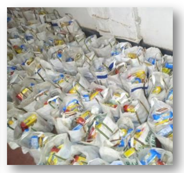
Individual food Packets ready for distribution