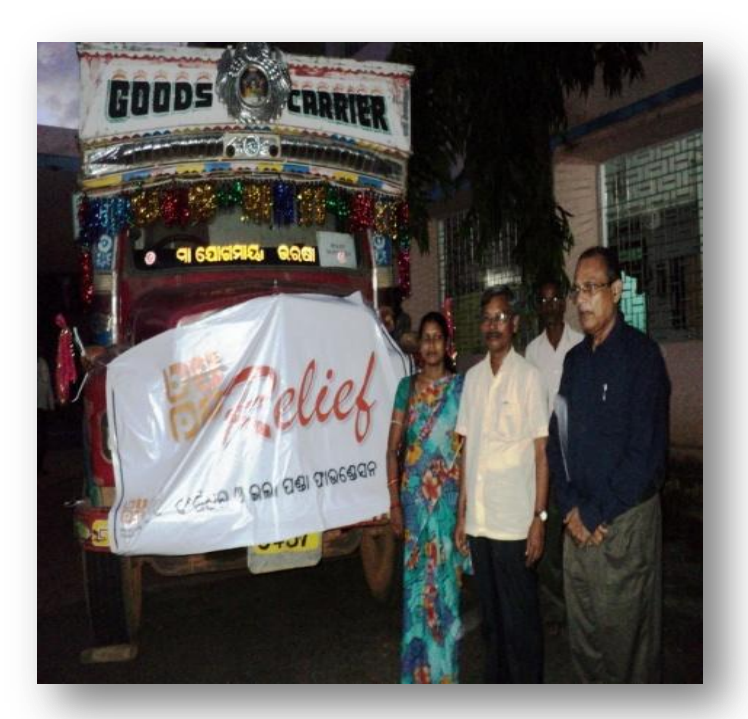
Food packets handed over to district administration, Jajpur