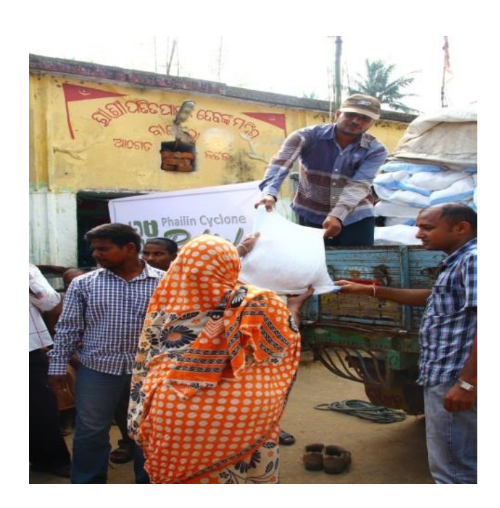
Family food packets being distributed at Athagarh,Cuttack